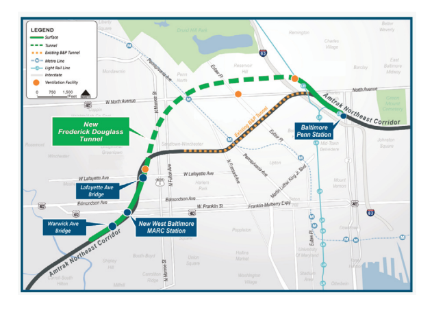
The New Tunnel Alignment